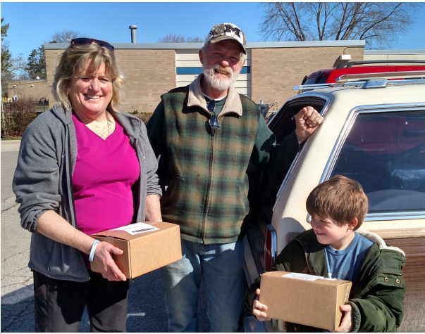
Meals on Wheels volunteers

say Meals on Wheels improves their health*