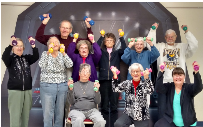
Enhance Fitness exercise class